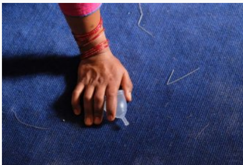
PHOTO: Menstrual cups are helping Nepal's girls avoid the chhaupadi ritual.

Read about our editorial guiding principles and the enforceable standard our journalists follow.