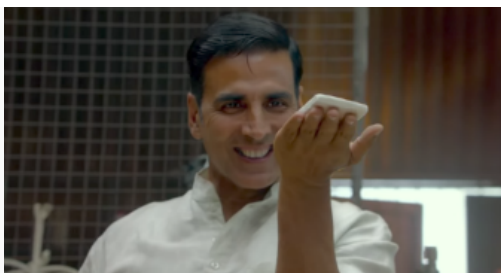
A Bollywood flick about sanitary napkins causes a stir in South Asia, with one country banning the movie without even watching it.

"Only the girls and women are now worse than before. Now they sleep without a hut."