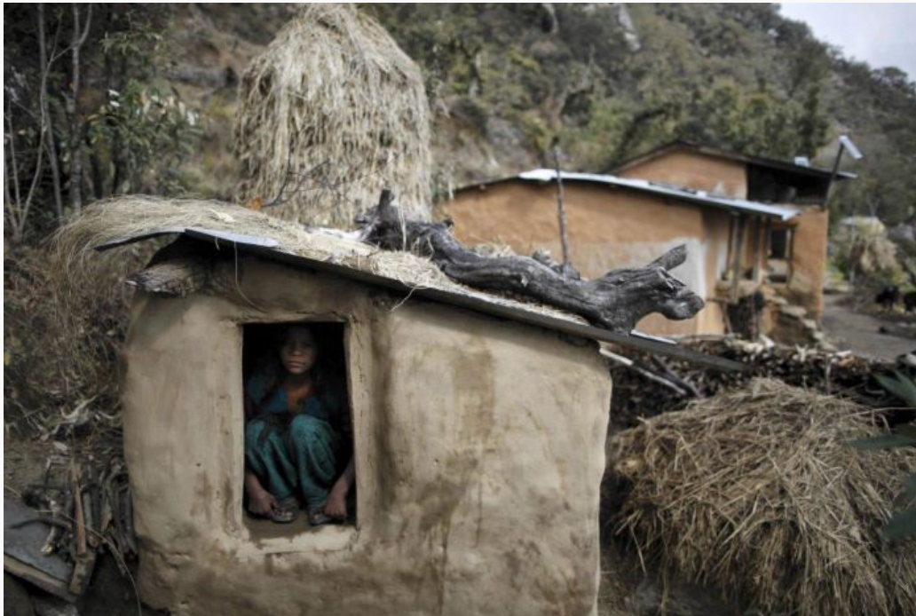
PHOTO: A 14-year-old girl sits inside a chhaupadi hut in the hills of Legudsen village.

By Tracey Shelton and wires Updated 14 Jan 2019, 4:36pm