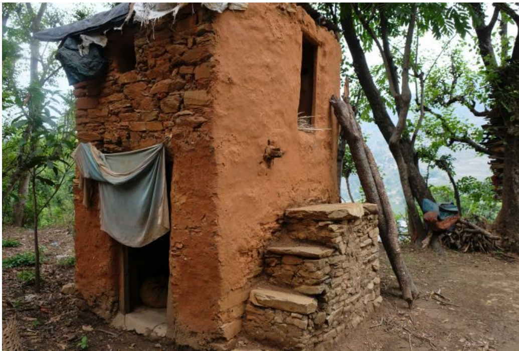
PHOTO: Women face many hazards during their banishment to these huts.